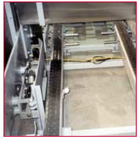
Basket Stacker Detail

* Specify RH or LH Configuration for Location of Panel, Operator Interface & Motors